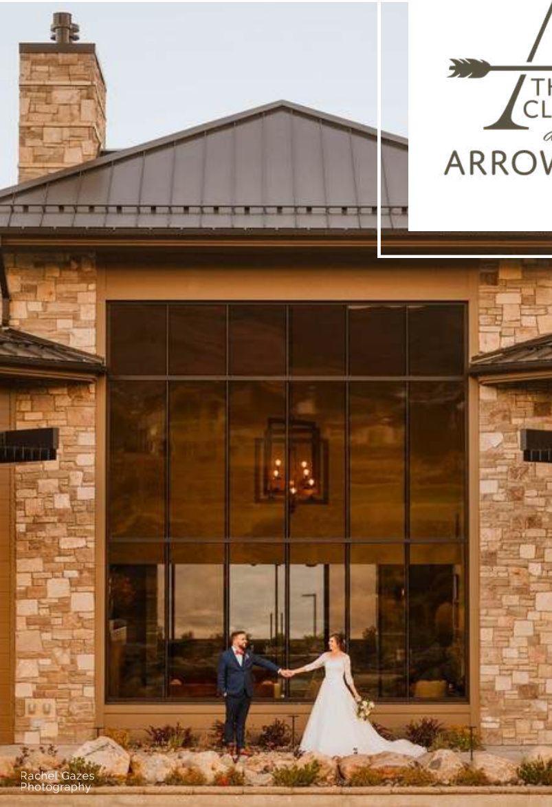
Rachel Gazes Photography