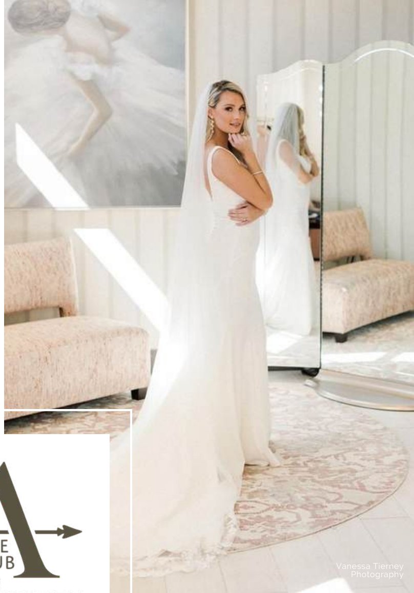
Vanessa Tierney Photography